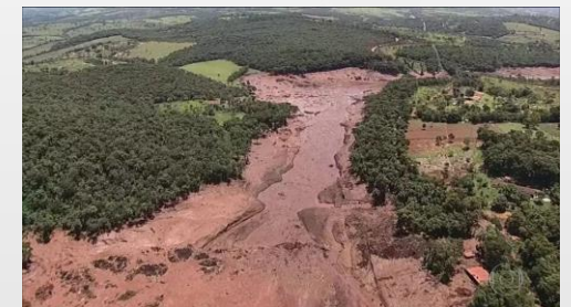
Brazil's deadly dam collapse